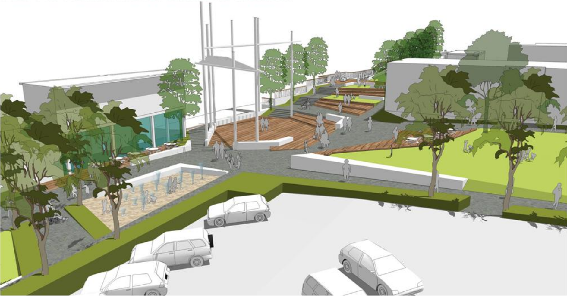
WALDIE PLAZA AND EVENT CENTER, ANTIOCH