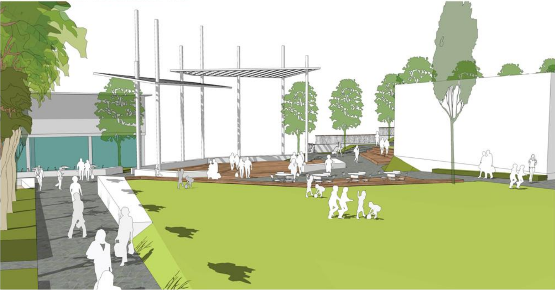
WALDIE PLAZA AND EVENT CENTER, ANTIOCH