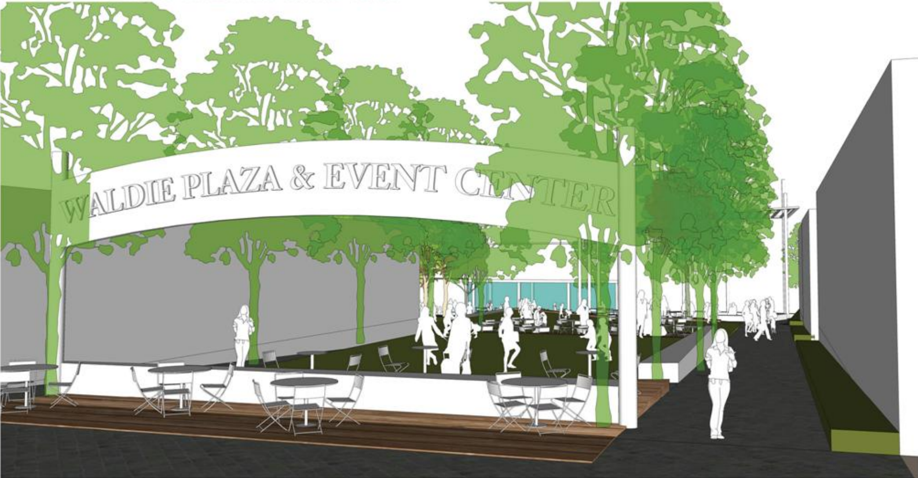
WALDIE PLAZA AND EVENT CENTER, ANTIOCH

VIEW FROM CITY HALL TO THE RIVER EMPHASIZED AND FRAMED CAFÉ SEATING AT 2ND STREET AND WITHIN PLAZA