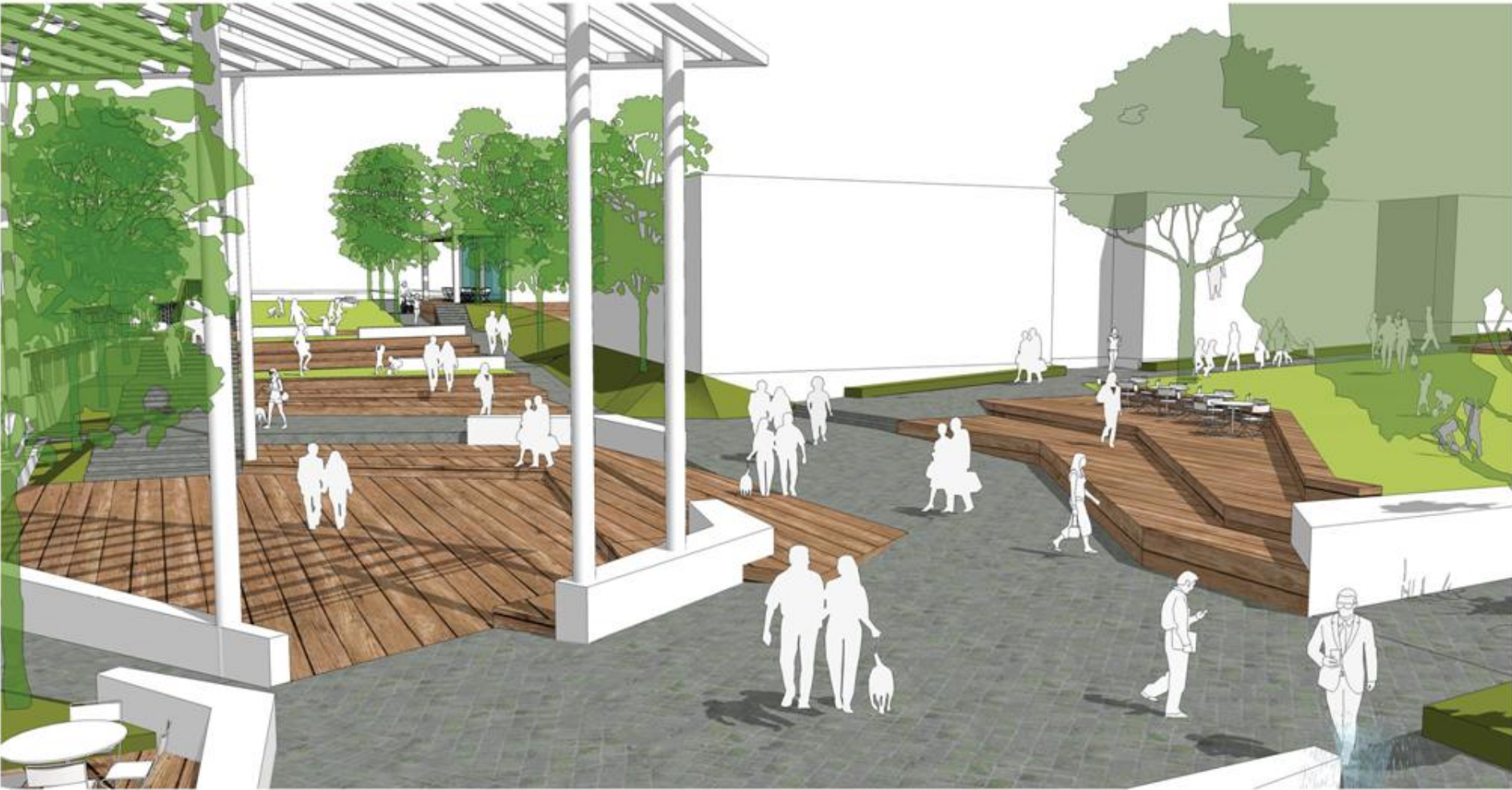
WALDIE PLAZA AND EVENT CENTER, ANTIOCH