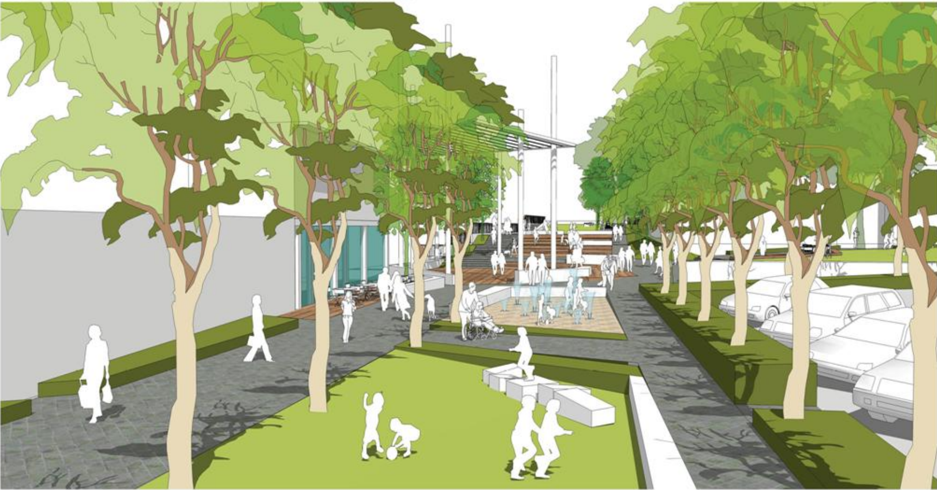
WALDIE PLAZA AND EVENT CENTER, ANTIOCH